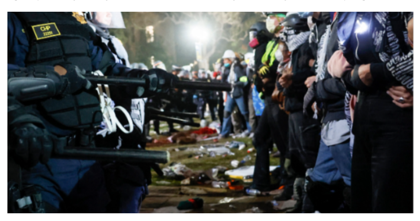
Students' encampment in LA, USA attacked by police

The deep crisis that has engulfed the society in the last few years due to Covid, the stringent control that ruled the society during the period of Covid, the high number of injuries and deaths caused by the vaccine and the severe censorship of the mainstream media and even social media is actually based on the trust and credibility of the government which has taken a serious blow. The wide spread of poverty, homelessness, the complete collapse of the social welfare system, the unquestioning support for the war in Ukraine and the Israeli genocide in Gaza, and the astronomical costs for the continuation of the war have intensified people's anger. And the government's only response to this