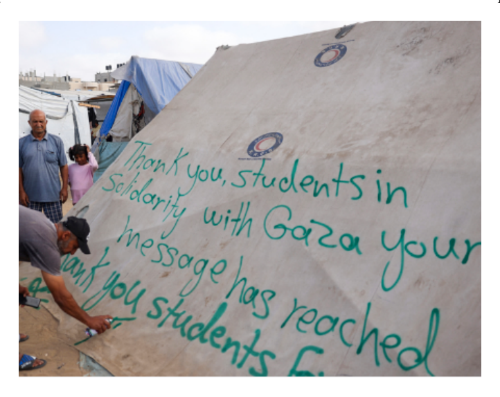
Palestinians in Gaza thanking students

Analysts and journalists opposing America and Israel mentioned the Islamic regime's military move as an