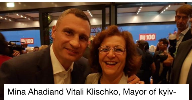
Mina Ahadi and Vitali Klischko, Mayor of Kyiv-

The Council of Ex-Muslims portrays itself as defender of freedom. It claims that taking part in conferences and occasions organised by governments and the mainstream media is part of its activities in order to highlight the plight of people in Iran. It sides itself with right wing organisations and political figures. What it conceals is that the western governments, ambassadors, and mass media welcome Ex-Muslim's policies because it is in alignment with their values.