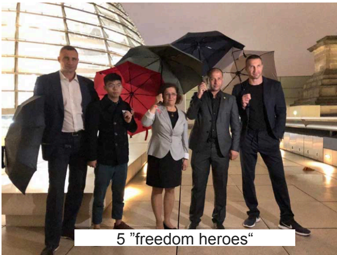
5 "freedom heroes"