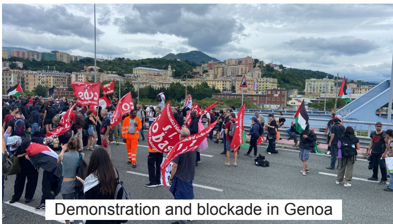
Demonstration and blockade in Genoa

This initiative succeeded in causing real damage to the bosses directly responsible for supporting Israel's genocidal apparatus, to the owners of the ships that transport death between Genoa and the ports of Haifa and Ashdod, to the terminal owners who called for and supported Italian military intervention in the Red Sea.