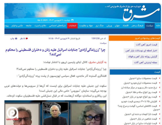
Pro Islamic regime's journal in Iran "Mashreq"

These three episodes only show that the worker-communist movement is rooted in Iran. Communism is popular. If our words had no listeners; if our words did not touch the hearts; if our faces did not bring hope to people, the Islamic regime would not have thought of falsifying our words. The Islamic regime is by nature shrewd and cunning. However, it is now stuck in a bad predicament and beats its head against the wall. With this distortion, the Islamic regime has shot itself in the foot. Using a communist, (whose enmity with the Islamic regime is well-known) to crush people's protest movement, will be detrimental to the regime.