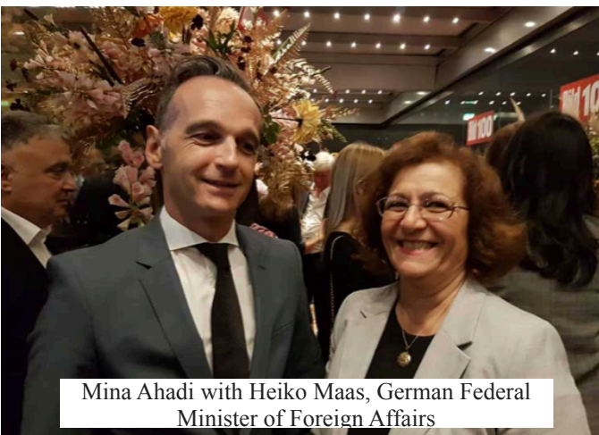
Mina Ahadi with Heiko Maas, German Federal Minister of Foreign Affairs